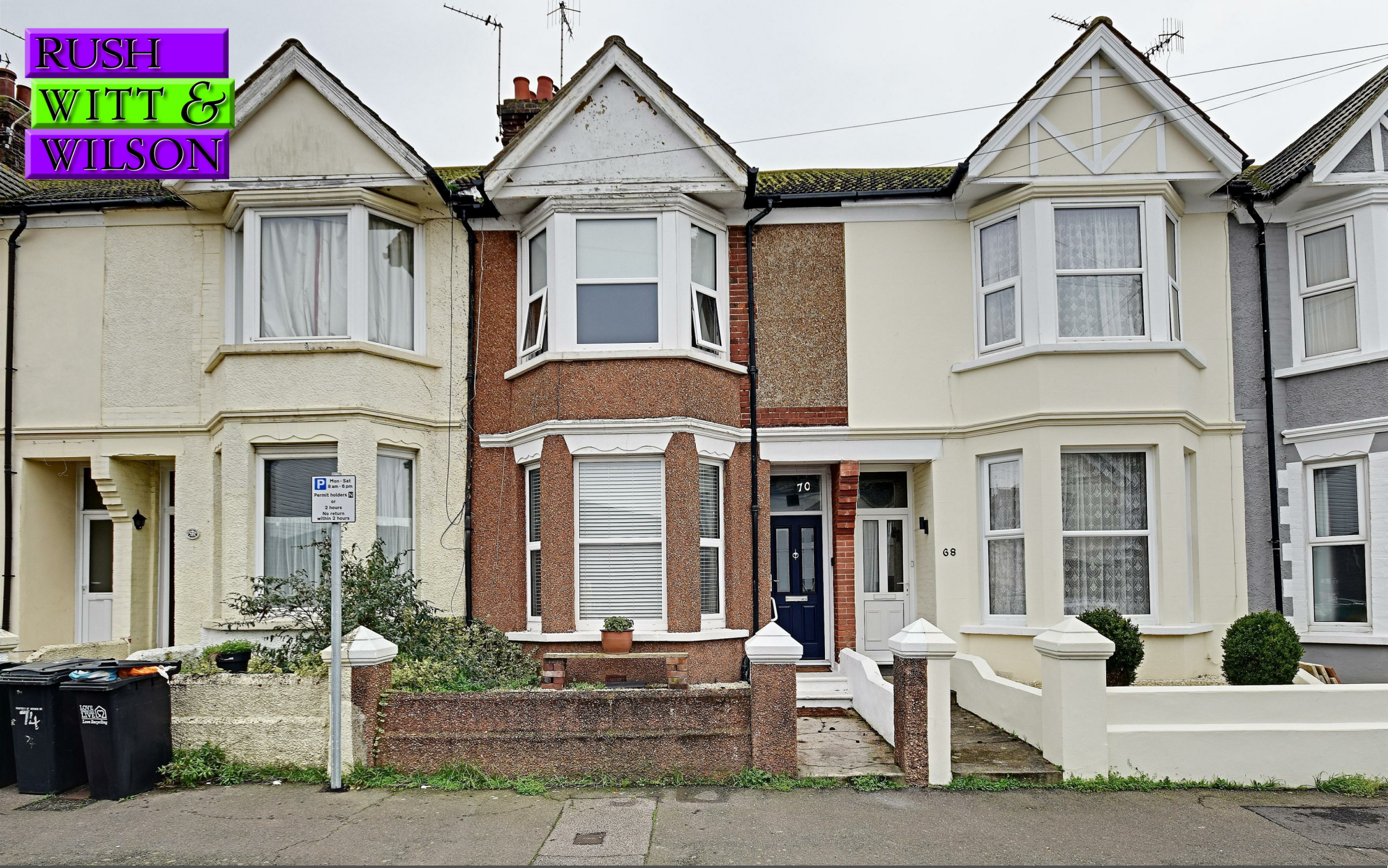
70 Reginald Road, Bexhill-On-Sea, Sussex TN39 3PG £295,000